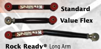
Rock Ready® Long Arm

Rock Ready® Series long arm links are 80% longer than stock, fitted with NG rebuildable rod ends with "Pivot Plus" inserts for maximum rotation.